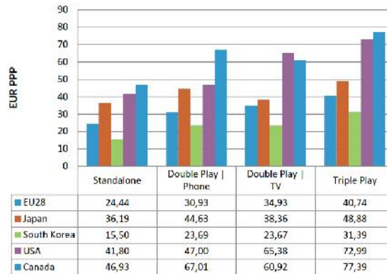
Figure 15 - EU28 least expensive prices compared to other countries in the world, 30-100 Mbps (in EUR/PPP, incl. VAT)